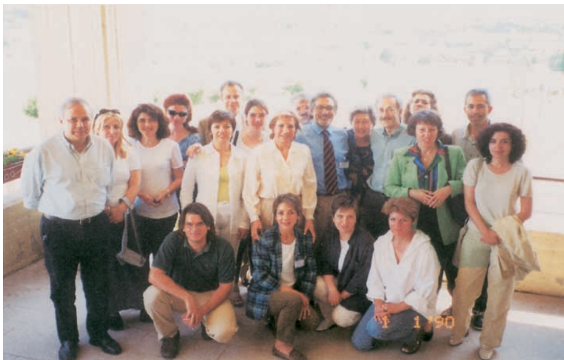
IUCP Thyroid Course May 22–24, 2000